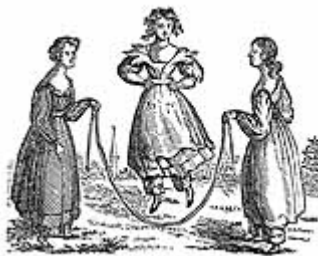
"Jumping Rope" in Mrs. L. Maria Child, The Girls' Own Book , (New York: Clark Austin & Co., 1838, p. 103.)

Parents' desire to maintain childhood innocence extended to ignoring physical gender differences for as long as possible. About 1830 androgynous clothing for young children became fashionable, and remained so until after 1900. Boys and girls wore a loose dress or belted smock to the knee and pantelettes (drawers) to the ankles. For boys, this replaced the tight little suit with pants and small jacket called the "skeleton suit." This was the first time girls wore a bifurcated garment (Pants!) and many adults thought it shocking. For the first time girls were able to play actively (and comfortably) alongside their brothers. For boys, this replaced the tight little suit with pants and small jacket called the "skeleton suit." This was the first time girls wore a bifurcated garment (Pants!) and many adults thought it shocking. For the first time girls were able to play actively (and comfortably) alongside their brothers.