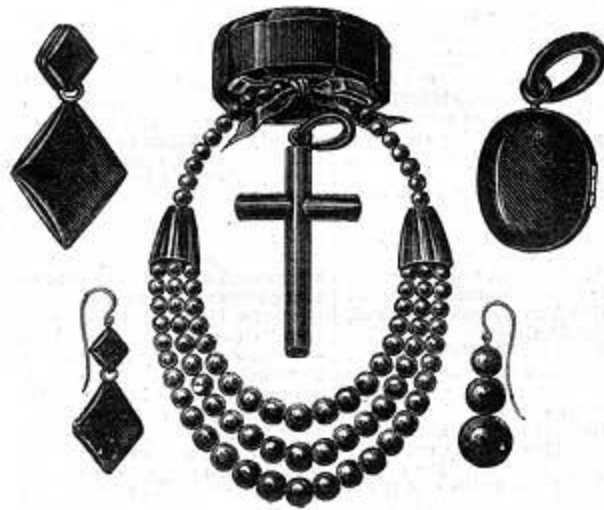
JET MOURNING JEWELRY.

Jet jewelry, as shown in Harper's Bazar 1879, was popularized by Queen Victoria. Jet is a variety of fossilized coal; the most prized and expensive is from Whitby, England. This set is composed of a necklace, bracelet, pendant, locket and earrings.